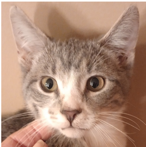
WHISKEY JACK (M).

DSH Brown tabby, 3 mo Loves attention and snuggling, and tends toward the reserved side. In foster. Adoption pending.