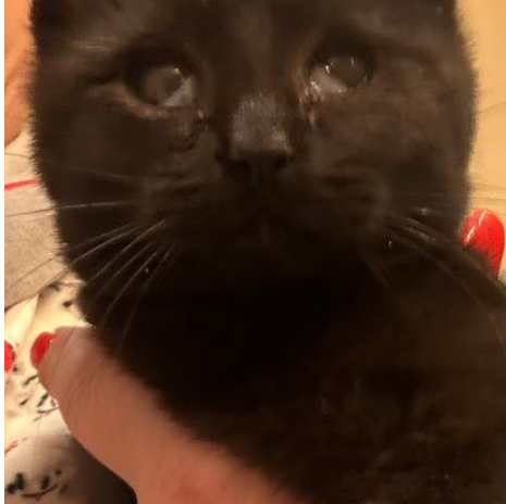
STINKY PETE (M).